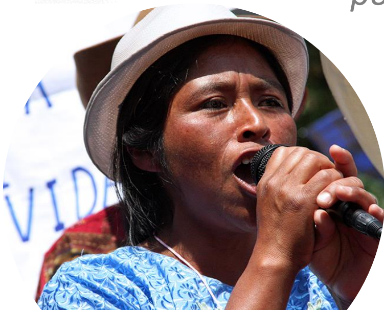
Support for human rights work in Central America

"Our vision is a just world based on solidarity, in which a good life is possible for everyone."