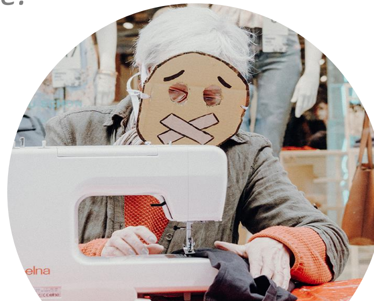
Campaign and educational work in Germany