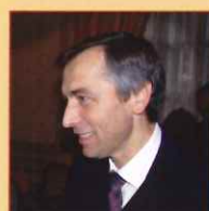
Jan Figel, European Commissioner