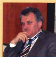
Aziz Polozani, Minister