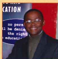
Romain Murenzi, Minister