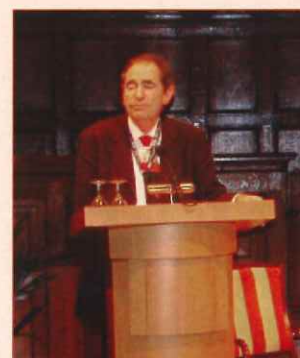
Albie Sachs, Judge