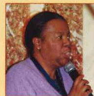
Naledi Pandor, Minister