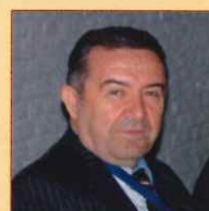
Misir Mardanov, Minister