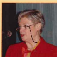
Maria J.A. van der Hoeven, Minister