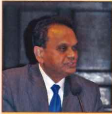
Ariranga G. Pillay, Chief Justice