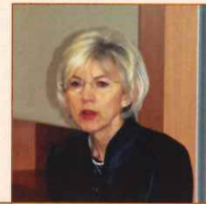
Beverly Mc Lachlin, Chief Justice