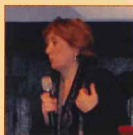
María Jesús San Segundo, Minister