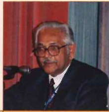
J.S. Verma, former Chief Justice