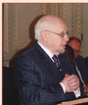
Mohammed Bedjaoui, former President ICJ